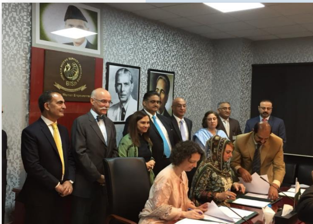
Signing of MoU between BISP and GD Pakistan's partner ASF Pakistan