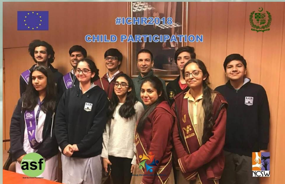
Human Rights Children and Youth Task Force: "We are one", children taking part in the International Human Rights Conference 2018, Islamabad, along with Director General, MoHR, HR & Development.