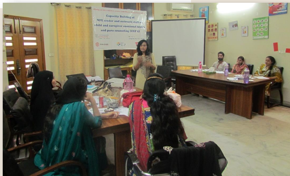
A training session delivered by GD Pakistan capacity building officer on child rights and child protection in Lahore.