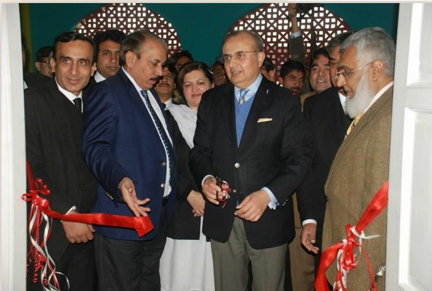
Inauguration of the Child Court on 20th December 2017 by then Chief Justice, LHC, Syed Mansoor Ali Shah